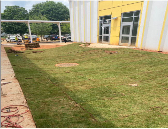
Begin landscaping and installing SOD