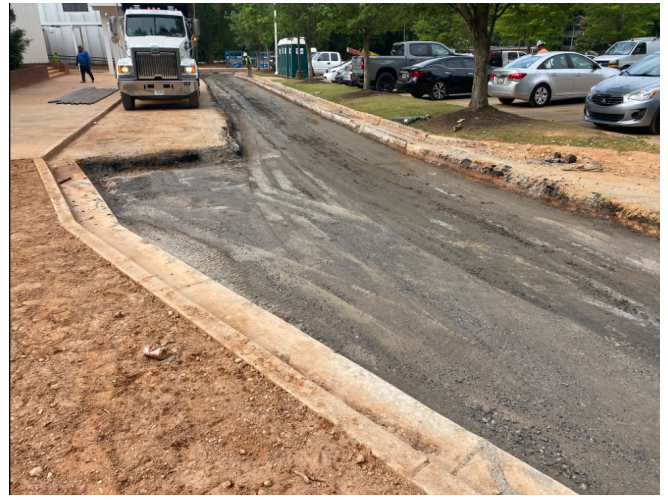
Begin asphalt paving rework