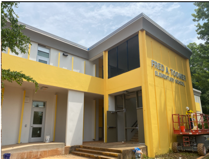
Exterior letter signage complete , continue with exterior paint finish