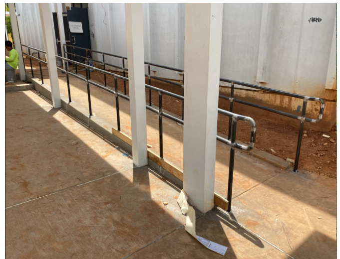
Continue with handrail install